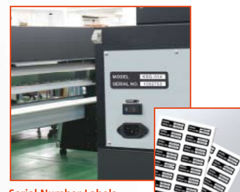
Serial Number Labels