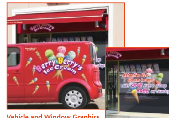
Vehicle and Window Graphics