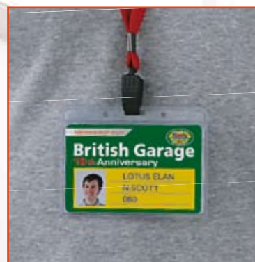
ID and Membership Cards