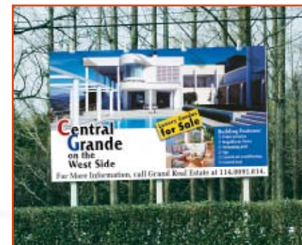
Durable Outdoor Signs and Billboards